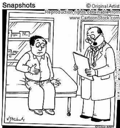
"I'm afraid that your irritable bowel syndrome has progressed. You now have furious and vindictive bowel syndrome."